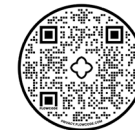
LFR QR Code

Lake Forest Ranch Camp. Kids age 7-12 are eligible to join us at LFR in Macon, MS, July 17-21. LFR's mission is building relationships for eternal impact. Please register by June 15 online at fpcbr.org .