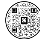
VBS QR Code

VBS Registration Now Online! Jerusalem Marketplace VBS engages all senses and transports your child to a different time and a fresh experience. Children entering kindergarten through 5th grade are invited to participate. Adults and youth are invited to volunteer as leaders and helpers. Please visit fpcbr.org/vbs for details and registration. VBS dates are June 19-23.