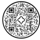
Conference QR Code

BOTH MEN AND WOMEN'S MINISTRIES HAVE EVENTS THIS WEEK announcements continue on back panel . . . OVER FOR MORE ANNOUNCEMENTS