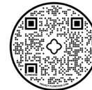
LFR QR Code

Lake Forest Ranch Camp. Kids age 7-12 are eligible to join us at LFR in Macon, MS, July 17-21. LFR's mission is building relationships for eternal impact. Please register by June 15 online at fpcbr.org .