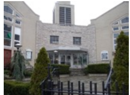
This is where we are staying!

NYC is often considered the most cosmopolitan city in the United States with residents from over 180 different countries. It is the headquarters of the United Nations. Immigrants of Irish, Italian, Chinese, Korean, Puerto Rican, Mexican, Dominican, Jamaican, Iranian, Arab, Greek, African, Jewish (and more) origin all have enclaves within the city.